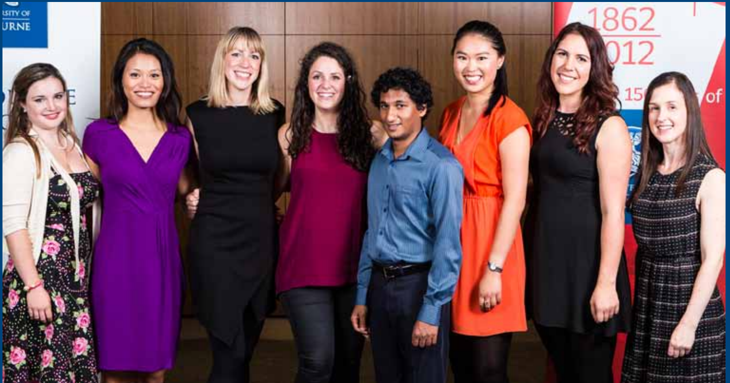
The inaugural MD/MPH student cohort